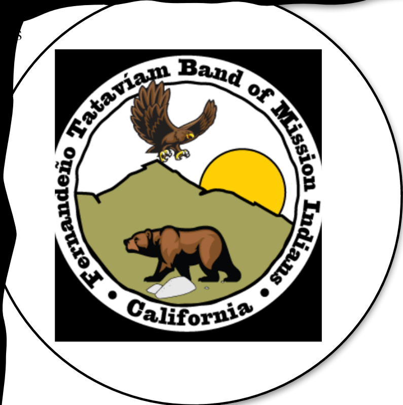
“People Facing the Sun”

Los Angeles Coun- talled Fernandēñ- e in lifestyle, harsh 3 the Fernandēñ- for land and re- nando Valley. In attempted to de- s for several years